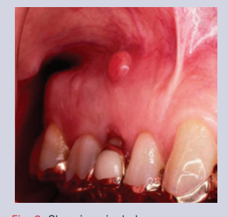
Fig. 2. Chronic apical abscess.