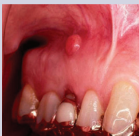
Fig. 2. Chronic apical abscess.

An acute apical abscess usually presents with rapid onset, spontaneous pain and swelling, both localized and intraoral, sometimes with exudate present, or with diffuse facial cellulitis. When the abscess is intraoral and localized (Figure 3), debridement of the pulp space and placement of calcium hydroxide and surgical incision for drainage is usually sufficient to resolve the problem. Systemic