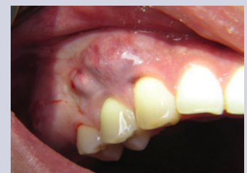
Fig. 3. Acute apical abscess with intraoral localized swelling.